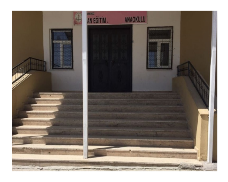
Figure 2. Star building school entrance without disabled stairs